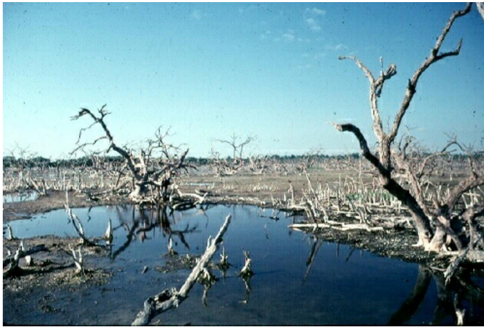
Figure 6a. Vegetation eliminated by flooding and high salinity at Impoundment IRC #12.

In many impoundments where the vegetation had been totally eliminated by overflowing and high salinity, simply restoring the tidal connection through culverts and monitoring flooding elevations resulted in a quick recovery of the herbaceous component (Figure 6), with mangroves lagging somewhat (Rey et al. 1990a).