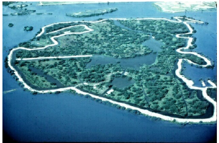
Figure 5. Gumbo Limbo Island project on the Banana River.

To accomplish these goals, the impoundment design included four culverts, a spillway, and a permanent pump. During October to May, the culverts remained open and allowed interchange between the lagoon and the impoundment. During the breeding season, water levels were maintained at the minimum necessary for mosquito control. This was possible because the permanent pump allowed replacement of water losses through evaporation and seepage. Two of the culverts were equipped with flapgated risers that opened when the water levels in the Indian River were higher than in the impoundment and thus allowed further interchange, even during the “closed” summer period. The other two culverts were closed using riser boards, which could be set at a given elevation and thus allow excess water to spill over the top. These functioned in conjunction with the spillway, which was simply a low area of the dike, to prevent vegetation damage by excessively high water levels. This project, known as the Gumbo Limbo Island Project (Figure 5), was one of the last impoundments constructed along the Indian River Lagoon, and was the first to purposefully use the technique now known as Rotational Impoundment Management (RIM).