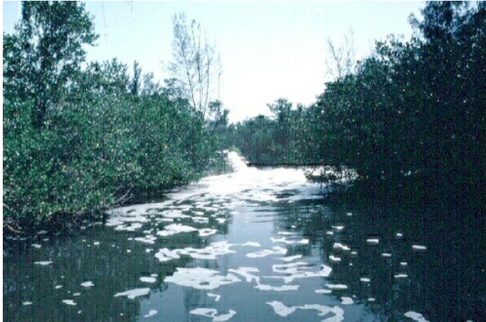
Figure 4. Pumping lagoon water into an impoundment.

waters during the summer but then left closed without further management (Figure 4). Natural surface and pore water quality patterns in these habitats are quite complex, and determining specific impacts is equally complicated. More detailed discussion of water and soil chemistry in impounded wetlands can be found in Brockmeyer et al. (1997); Rey and Kain (1993); Rey et al. (1986, 1989, 1990a, 1990b, 1990c, 1991b, 1992); and Carlson et al. (1983).