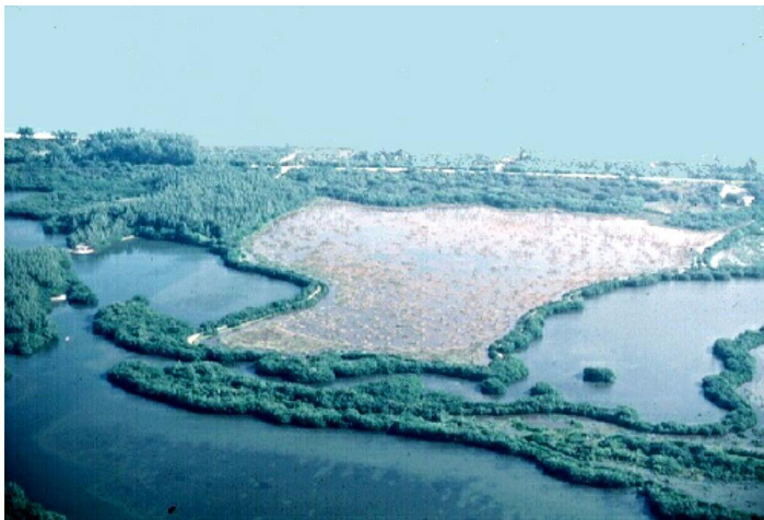
Figure 2. Vegetation damage in an overflooded impoundment.

Within some impoundments, wetland vegetation was virtually eliminated because the impoundments were flooded to much higher levels than needed in order to compensate for evaporation and seepage (Figure 2).