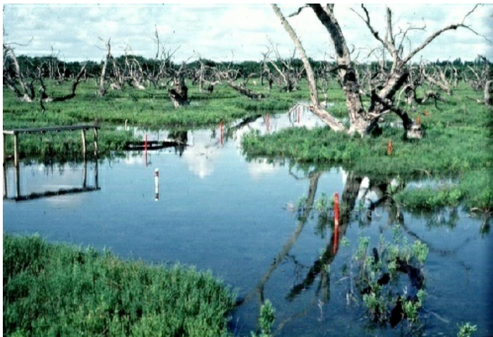
Figure 6b. Vegetation recovery at Impoundment IRC #12.

Moreover, the water management capabilities associated with RIM have also allowed the manipulation of water levels to control exotic and upland vegetation in some impoundments, particularly in the Merritt Island National Wildlife Refuge.