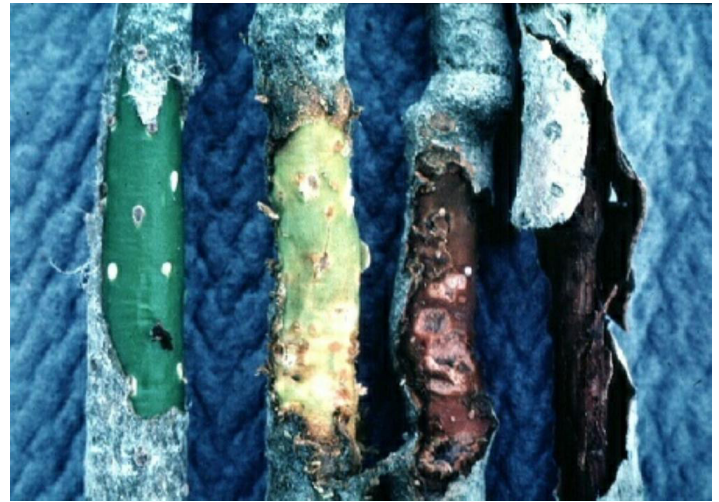
Figure 3. Damage to black mangrove pneumatophores due to overflooding.

Overflooding eliminated the herbaceous halophyte (salt tolerant) cover (such as Batis maritima , Salicornia virginica , and Salicornia bigelovii ) from some of these marshes (Rey et al. 1990a, 1990b, 1990d, 1990e). Likewise, black mangroves were eliminated from some because their short pneumatophores (above-ground roots) cannot withstand prolonged flooding (Figure 3).